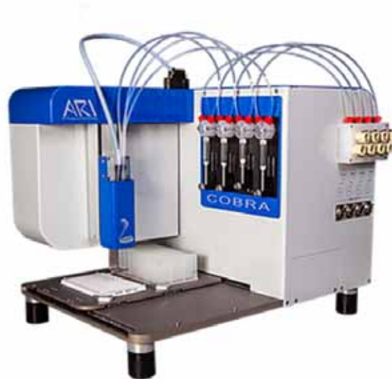
“Cobra 4 Channel“